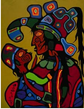
Norval Morrisseau (1931 - 2007) Artist's Wife and Daughter , 1975 acrylic on masonite 101.6 x 81.3 cm Purchase 1975 McMichael Canadian Art Collection 1981.87.1