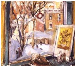
Arthur Lismer (1885 - 1969) From My Window - Montreal , 1940-49 oil on wood panel 36.2 x 40.5 cm Purchase 1986 McMichael Canadian Art Collection 1986.4